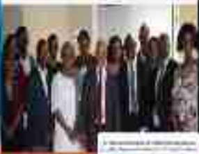
A group of people, including students and faculty, standing together in a hallway or classroom setting.