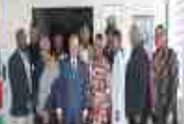
Students and faculty members from the University of California, Berkeley, are shown in a classroom setting, engaged in a discussion or presentation.