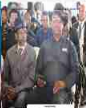
[Illegible text, likely names and titles of the individuals in the photo above.]

[Illegible text in a red-bordered box, likely a quote or a key message.]