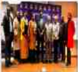
Community meeting attendees at the University of South Alabama Ballroom.

On March 15, 2018, the University of South Alabama hosted a community meeting for faculty, staff, and students. The meeting was held in the University of South Alabama Ballroom and was attended by approximately 100 people.