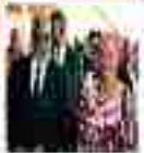
...the ... of ...